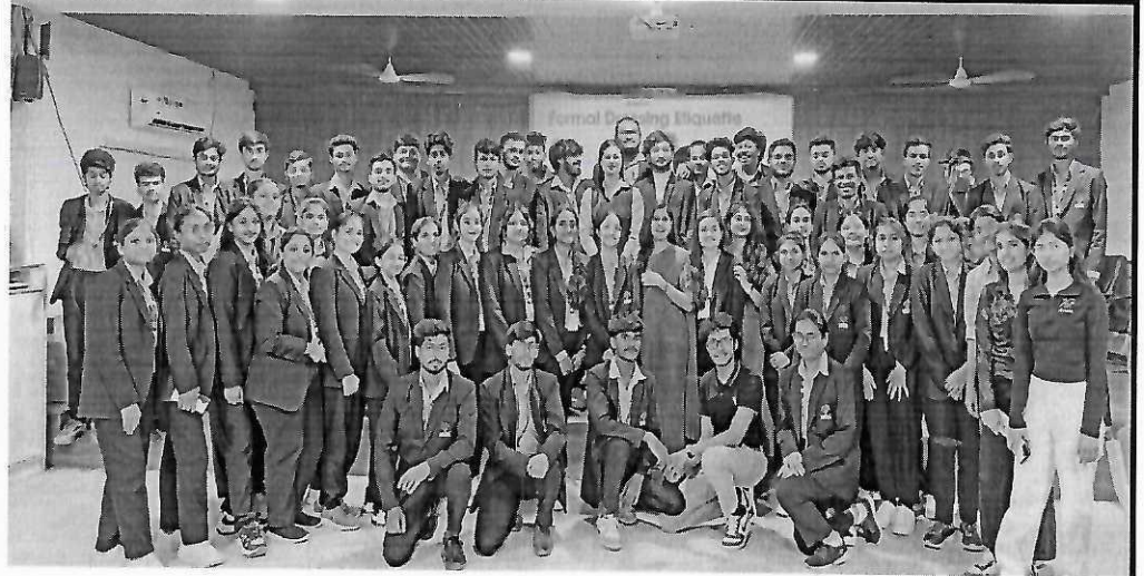
Group photo of the event with resource person